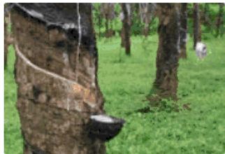
HISTORY OF MARPG